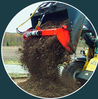
Sorting of soil.