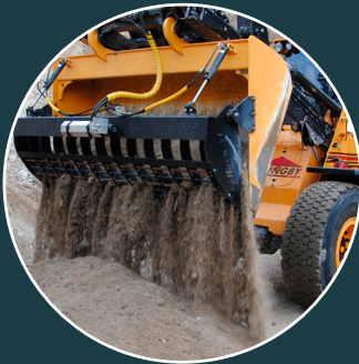
Sorting of sand.